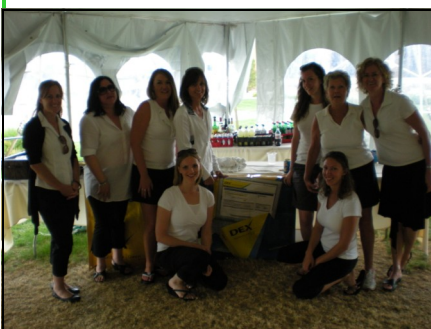
THE STAFF WITH THE SIGNAGE OF OUR MAJOR SPONSOR, DEX ONE.